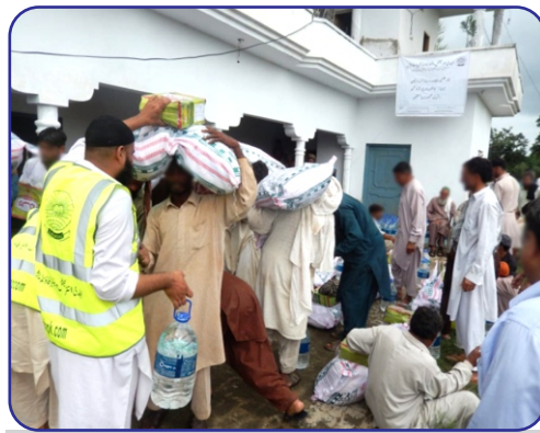
Distribution of ration amongst affectees

Al-Huda Mirpur branch started its aid activities in Azad Kashmir in the immediate aftermath of the 25 th September earthquake. Aside from medical aid, the team also provided coffin for burial, shelter for the homeless, clothes, food and bedding. Overall, 760 ration packs, 300 blankets and pillows and 450 beds were provided. Six wheelchairs were also distributed. In the next phase, 25 homes will be built for widows comprising a room, kitchen and washroom.