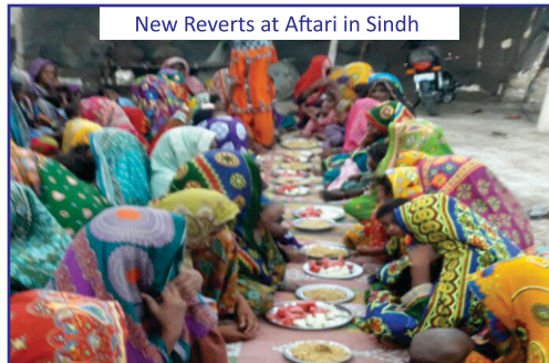
New Reverts at Aftari in Sindh

Like previous years, this year also prior to Ramadan Al-Huda made arrangements to provide ration for the needy far and wide across the country. About 9,198 packages comprising of basic commodities were distributed in Punjab, Kashmir, Sindh, Khyber Pakhtunkhwa and Baluchistan. Apart from distributing ration, Iftar arrangements were made for areas in Karachi, Lahore, Multan, Raheem Yar Khan, Gojar Nawala, Wah Cantt, Meerpur and other regions. Large number of people benefitted from these campaigns.